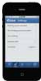
iOS, Android compatible