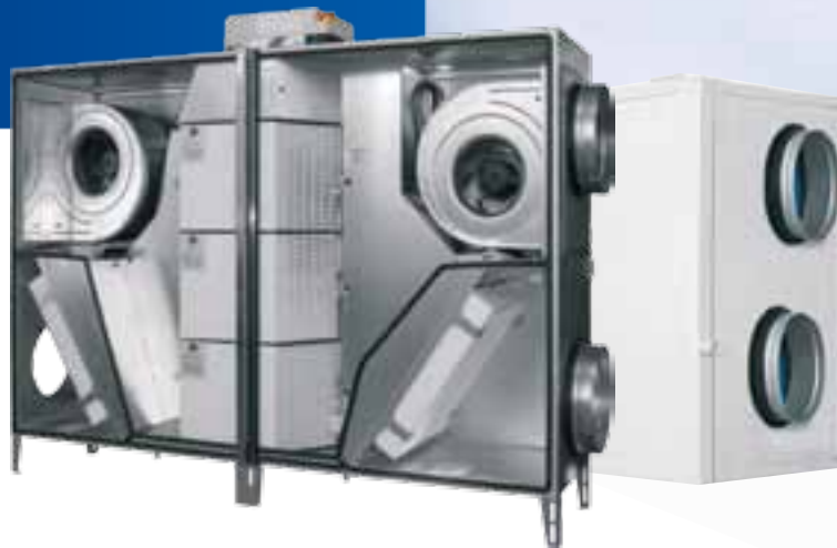
DUPLEX Flexi and DUPLEX EC4

ATREA is a leading company in ventilation and heat recovery. ATREA means top quality, continuous innovation, excellent performance and sensitive partnership approach. Thanks to all these advantages ATREA provides products near to state of art. As a result of deep technical knowledge, long tradition and constant market attention ATREA products are well known in all Europe and introductory negotiations are taking place with customers from overseas.