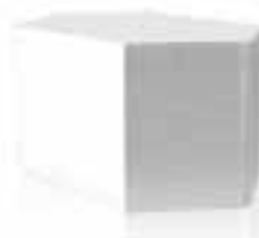
Own production of plate counterflow heat recovery exchangers